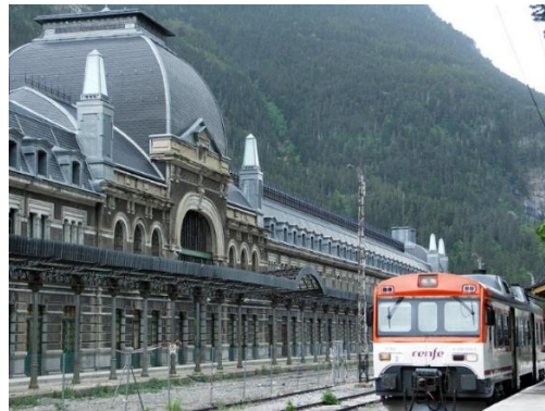
Canfranc train station