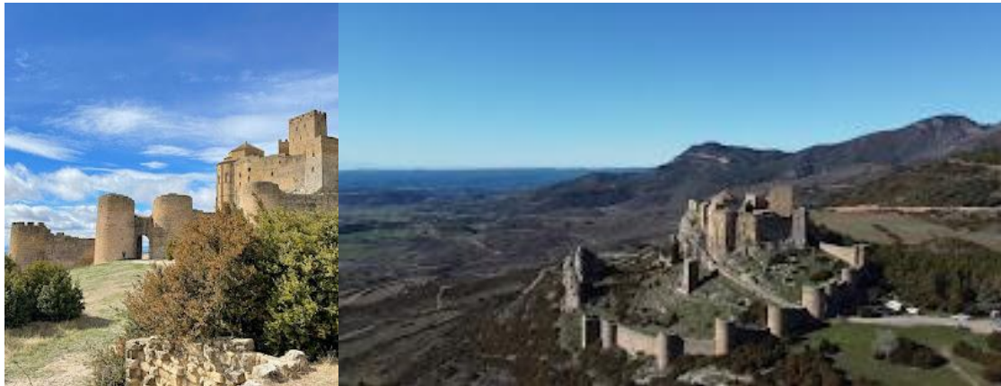
Castle of Loarre

Castle of Loarre, Colegiata Church of Bolea and Mallos de Riglos