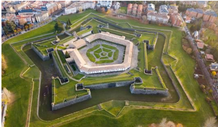
Citadel of Jaca