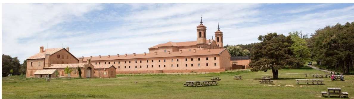
Visit to the Monastery of San Juan de la Peña