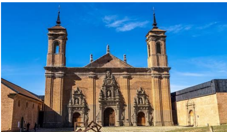
St. Peter's Cathedral