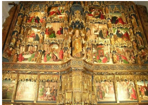
Collegiate church of Bolea