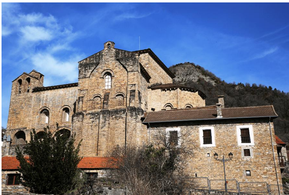
Monastery San Pedro de Siresa