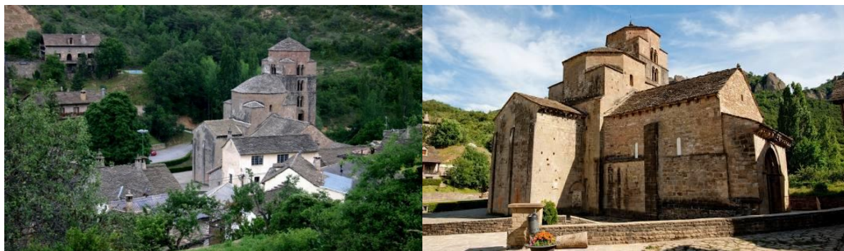
Romanesque Monastery of Santa María