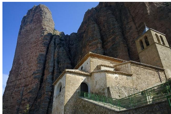
Mallos de Riglos