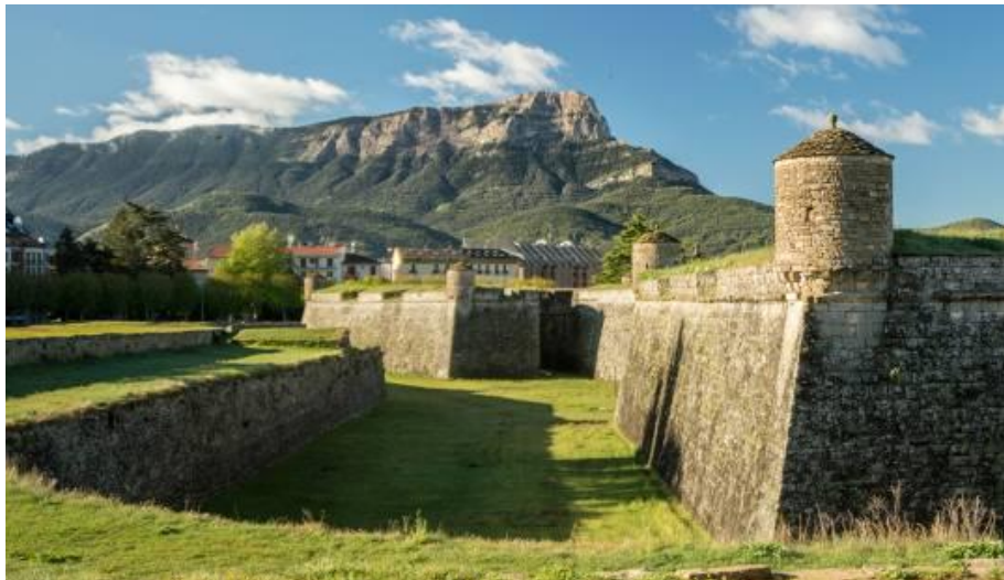
Citadel of Jaca