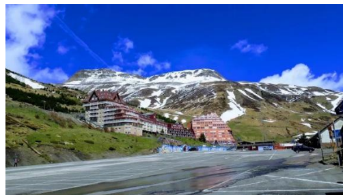
Glaciers of Astún